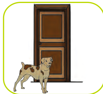
A DOG AT THE DOOR