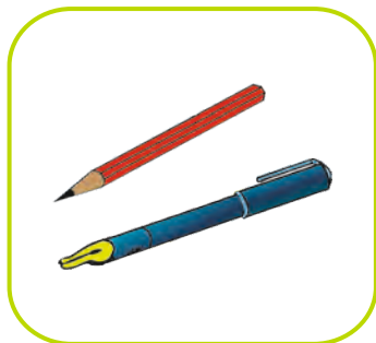
A PENCIL AND A PEN