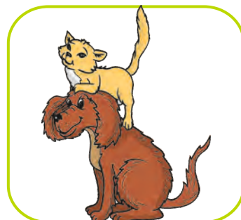
A CAT ON A DOG