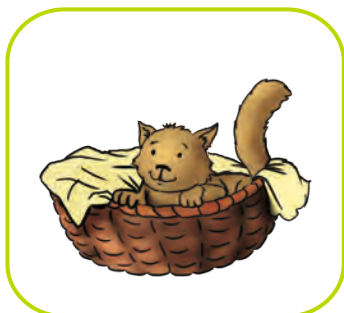
A CAT IN A BASKET