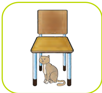
A CAT UNDER THE CHAIR